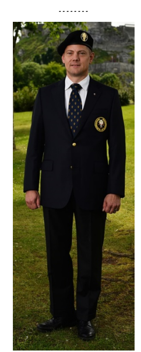
As mentioned on Page 1, this photo shows the new standard Fourth Degree Color Corps regalia.